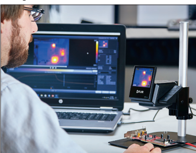
Connect over USB a computer to analyze data in FLIR Tools+